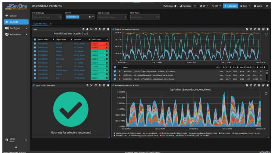
Most utilized interfaces